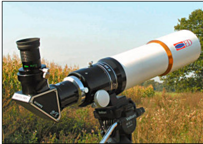
The Megrez 80 II ED triplet APO

I purchased the Megrez on a Friday, and on my way to the William Optics-dealer I was hoping and praying for a clear evening and night... Later that day the clouds slowly, but surely rolled away and a clear sky revealed