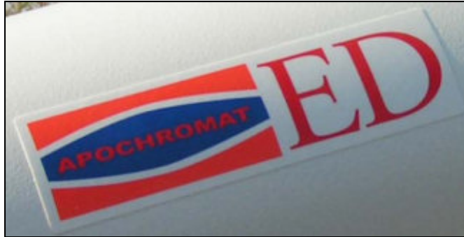
This sign stands for color free optics and high contrast images. Maybe this transfer shouldn't be made out of paper, because it's not in balance with the outstanding quality it represents...

This little scope really has excellent optics! Although it's not an instrument for use at high powers, the Megrez can and will deliver if you put it to the test! On a nice evening in August, with the moon low in the sky, I observed the craters and seas with a